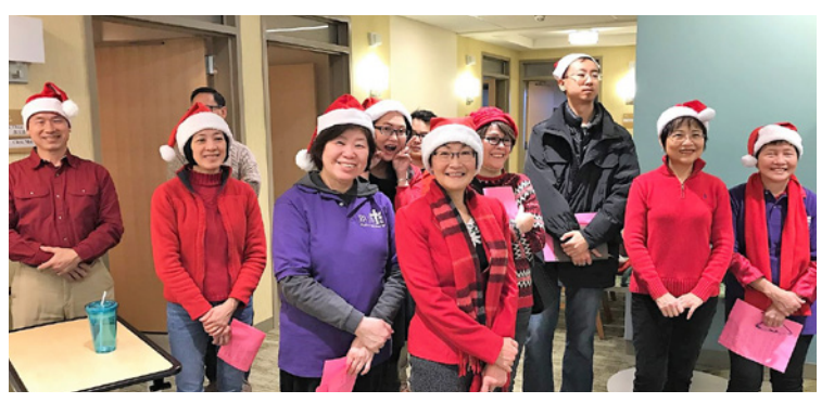
Christmas Carol at Quincy South Cove Rehab (12/23): Multi-generational brothers and sisters from BCEC sang Christmas songs to the elderly residents at Quincy South Cove Manor. We brought the joy and peace of Jesus to the house of elderly care.