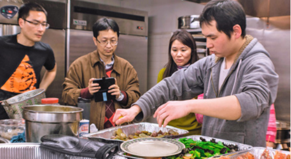
Servant appreciation dinner (12/11): Chinatown Mandarin ministries prepared a sumptuous dinner to appreciate all the staff, elders, deacons, and many more who have served in our church.