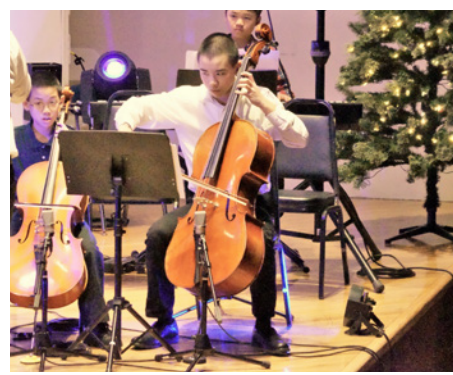
Advent Concert (12/2)