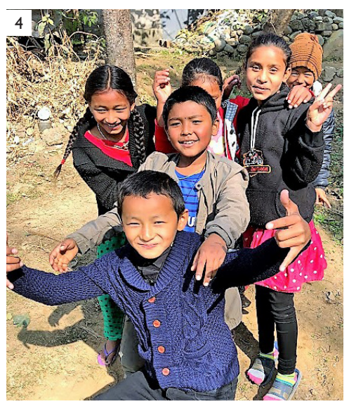
1) Our team was able to train Nepalis from over 33 churches in two cities during our two-week stay. 2) Nepalis young and old go to the temple to pray and worship their gods. 3) Treated the children from a children home to a sunrise excursion with the Himalayan mountain range in the background 4) Children we met during our church visit