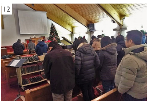
9-10) The children's activity organized by the Child Evangelism Fellowship during the Christmas Eve Service on 12/24 attracted children of all ages to celebrate the true meaning of Christmas. 11-12) New Year Prayer Meeting (1/1)