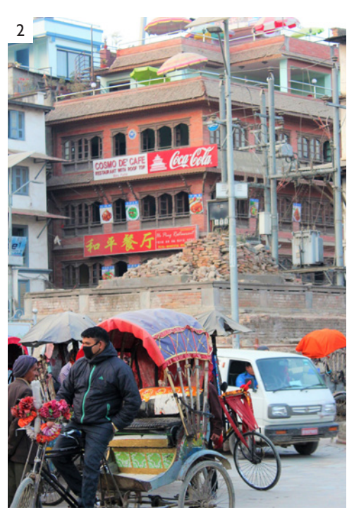
I) A beggar outside the Buddhist temple 2) A pile of bricks left of a Hindu temple from the devastating earthquake in 2015

ther ran outside to check out the situation. Their neighbors did as well, but found no trace of any incident. The next day, the boy's condition took a turn for the worse and had to check into the hospital. Sadly, her brother passed away soon after. The family later found out from other neighbors that the new apartment they moved into was cursed. Tenants did not stay beyond a few months because the apartment was haunted by a spirit. The neighbors believed the spirit was that of a woman who lived there and committed suicide by jumping off