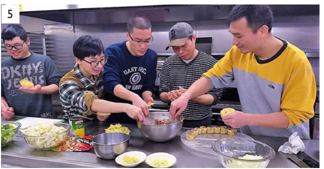
Christmas celebration in various Chinatown Mandarin fellowships: 1) Berea Fellowship (12/11) 2-4) Paul Fellowship (12/22) 5) Timothy Fellowship (12/25)