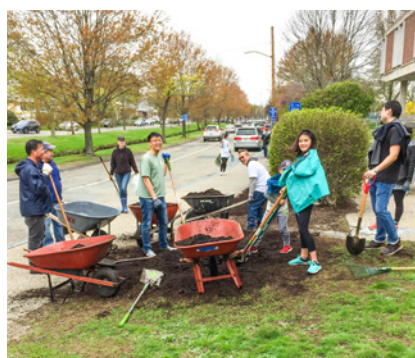
NewtonSERVES 2019 (4/28)