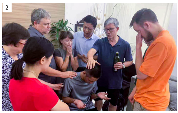
I) Spung in Ta Prohm Tree Temple, which reminds us of God having victory over every stronghold in our lives 2) Prayer Meeting with missionaries and anointing brother on team to be an apostle for his people