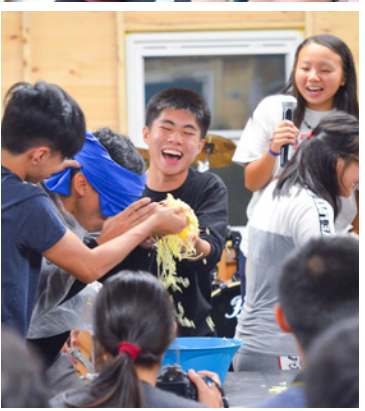
Base Camp 2019 (8/23-8/26)