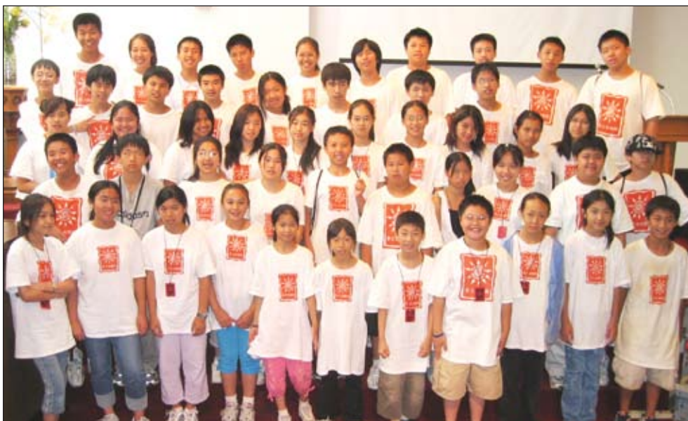
Project Destiny 2006 Campers

All this would be nothing more than a fun summer if not for the saving power of the gospel and the continuing commitment to these youth. A delightful reward for counselors is seeing campers integrate into one of our church's Chinatown youth groups—Joshua Youth, TWR, or Teen Fellowship—as the Holy Spirit continues His work in them.