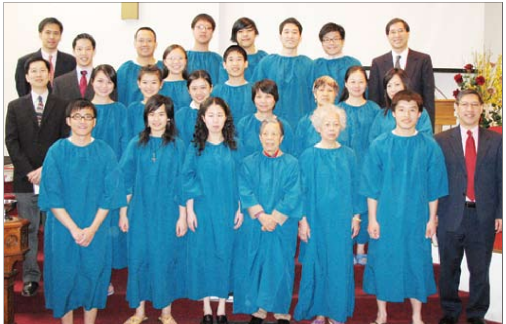
Easter Baptism 2007

Second, we can prepare to give financially. Many of us have experienced setting aside money weekly to pay for a large expenditure, like a house or col-