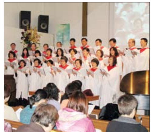
Left: Preparing care packages at the Social Responsibility Conference; Right: Sacred Music Sunday