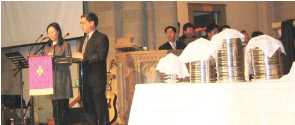
Good Friday Service at the Newton Campus

With the goal of integrating campers into BCEC, PD began to pilot year-long programming this past September. As BCEC's vision statement states, "Because God has blessed us, we strive to be a blessing to the Chinatown community... by sharing the love of God and the Gospel of Jesus Christ." As another cycle begins, we pray PD becomes a continuous year round blessing with programs such as community guitar classes, a homework drop-in center, and whatever else the Lord provides. What a testimony it would be for our neighbors to see BCEC not only worshipping God on weekends, but also serving the people in our community every day of the week, all year long! Just as BCEC seeks physical expansion, we pray for expanding the ways we bless others, especially those who don't know Christ.