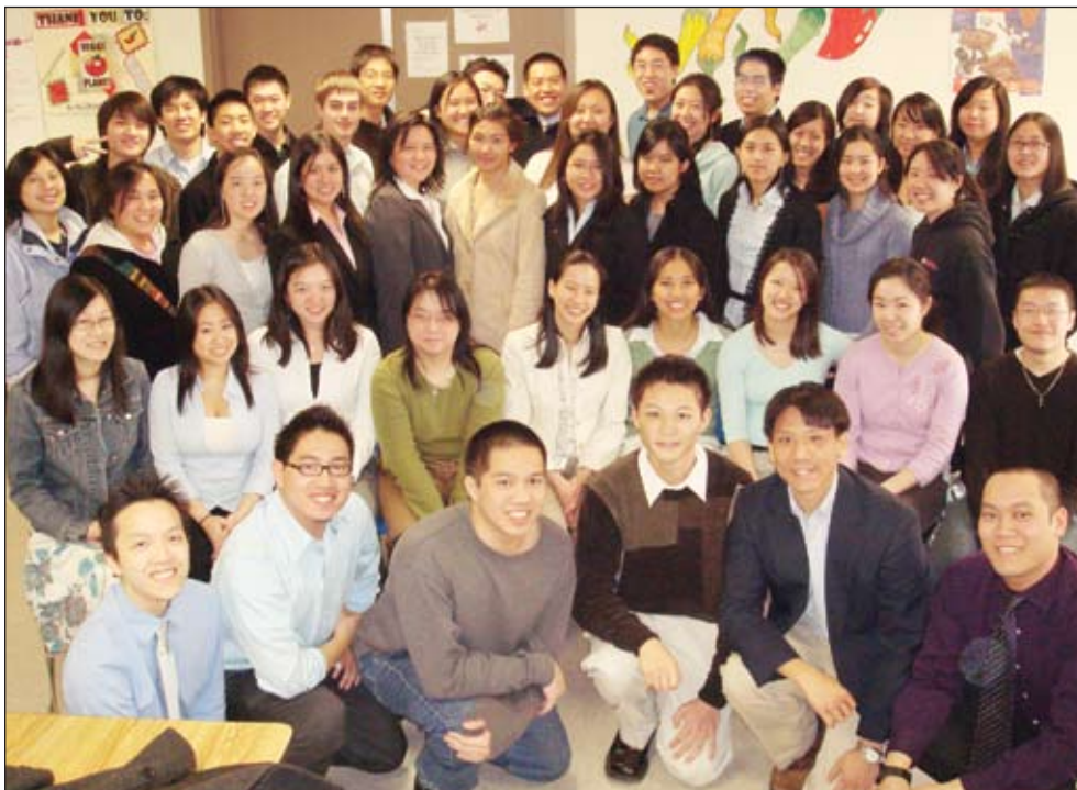
English College Ministry Sunday School

Future Plans. To engage and encourage more people to create vital marriages and strong families by applying God's principles, we are planning