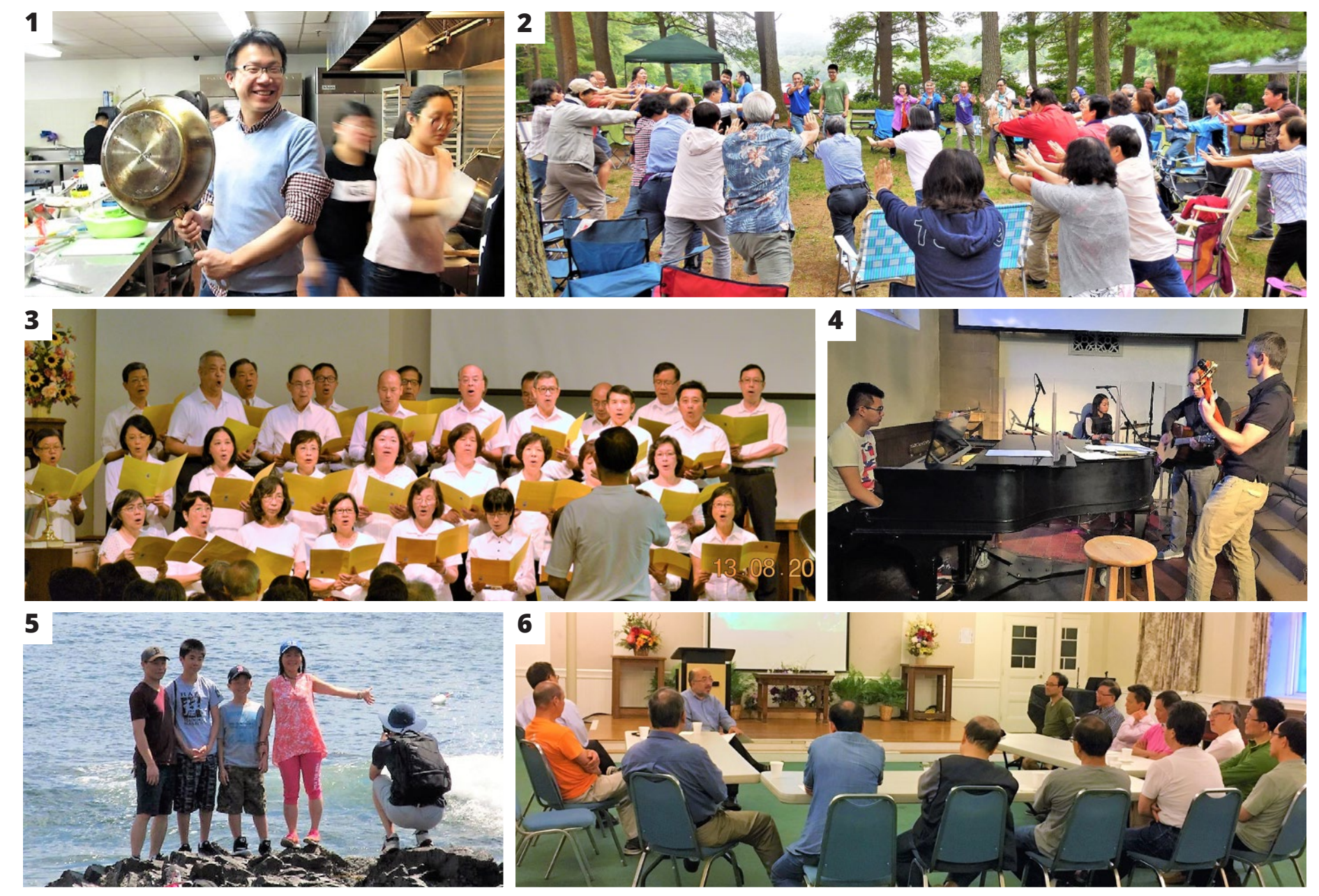
1) Emmanuel Fellowship (Chinatown Mandarin College and Young Adult): Cooking Contest 2-3) Song of Songs Fellowship: Enjoying an outdoor exercise together at an outing; Song offering at Chinatown Cantonese 2nd worship service 4) United! Bible Study (New Community Adult): Worshipping the Lord during worship practice 5) Timothy Fellowship (Chinatown Mandarin Adult): Outing at Ogunquit, Maine 6) Peter Fellowship (Cantonese Men): Workshop and discussion during a fellowship meeting