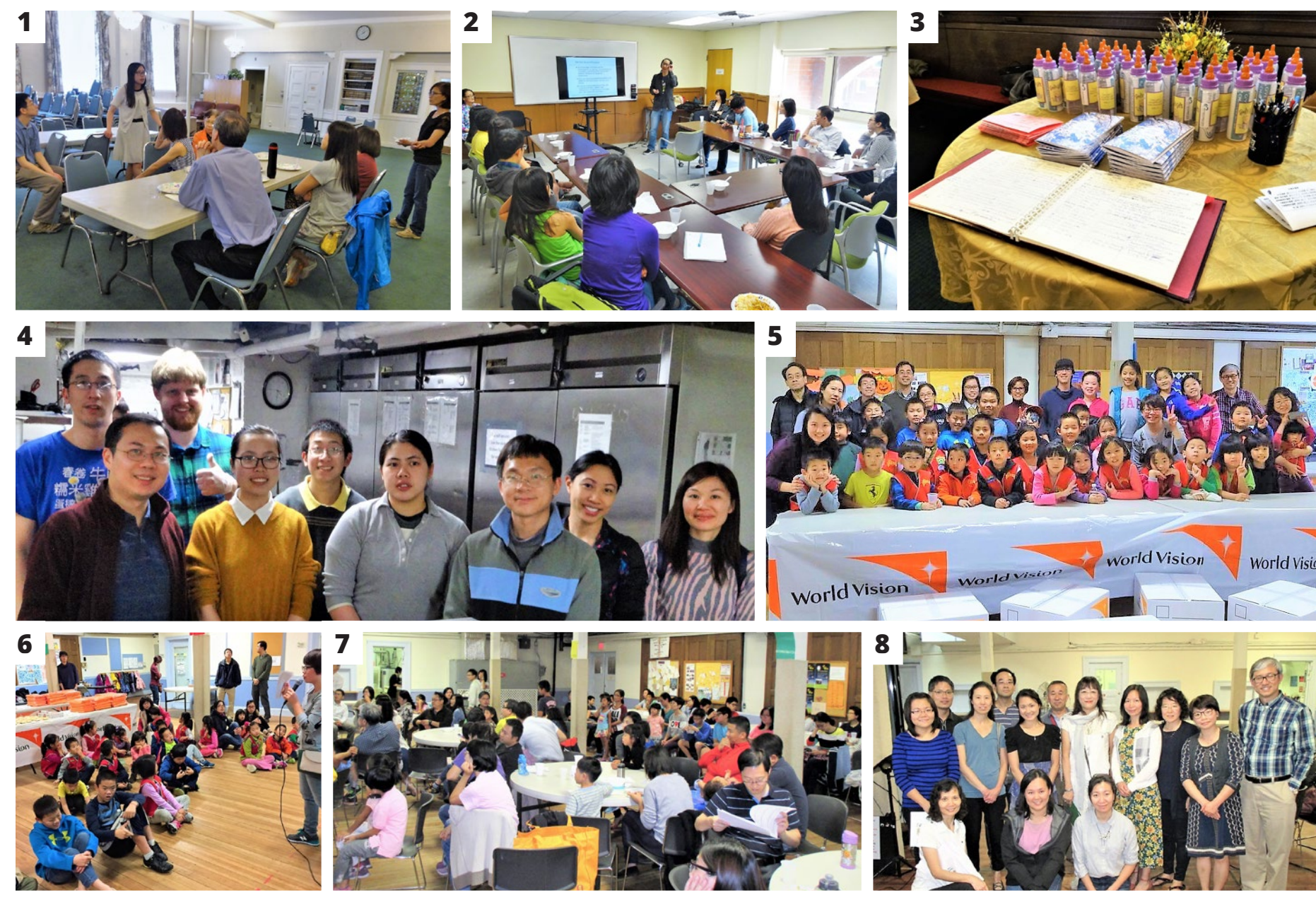
1-5) Social Responsibility Committee: We have hosted many events this year to raise awareness and mobilize people to live out their faith. A few highlights include Open House to encourage conversations on social issues, baby bottle campaign to raise funds for Boston Center for Pregnancy Choices, partnering with Boston Rescue Mission to serve the homeless, and partnering with World Vision in Boston Hope Program. 6-8) Awana: Boston Hope Program at Awana; Many parents attended our first Awana night; Teachers serving in Awana.