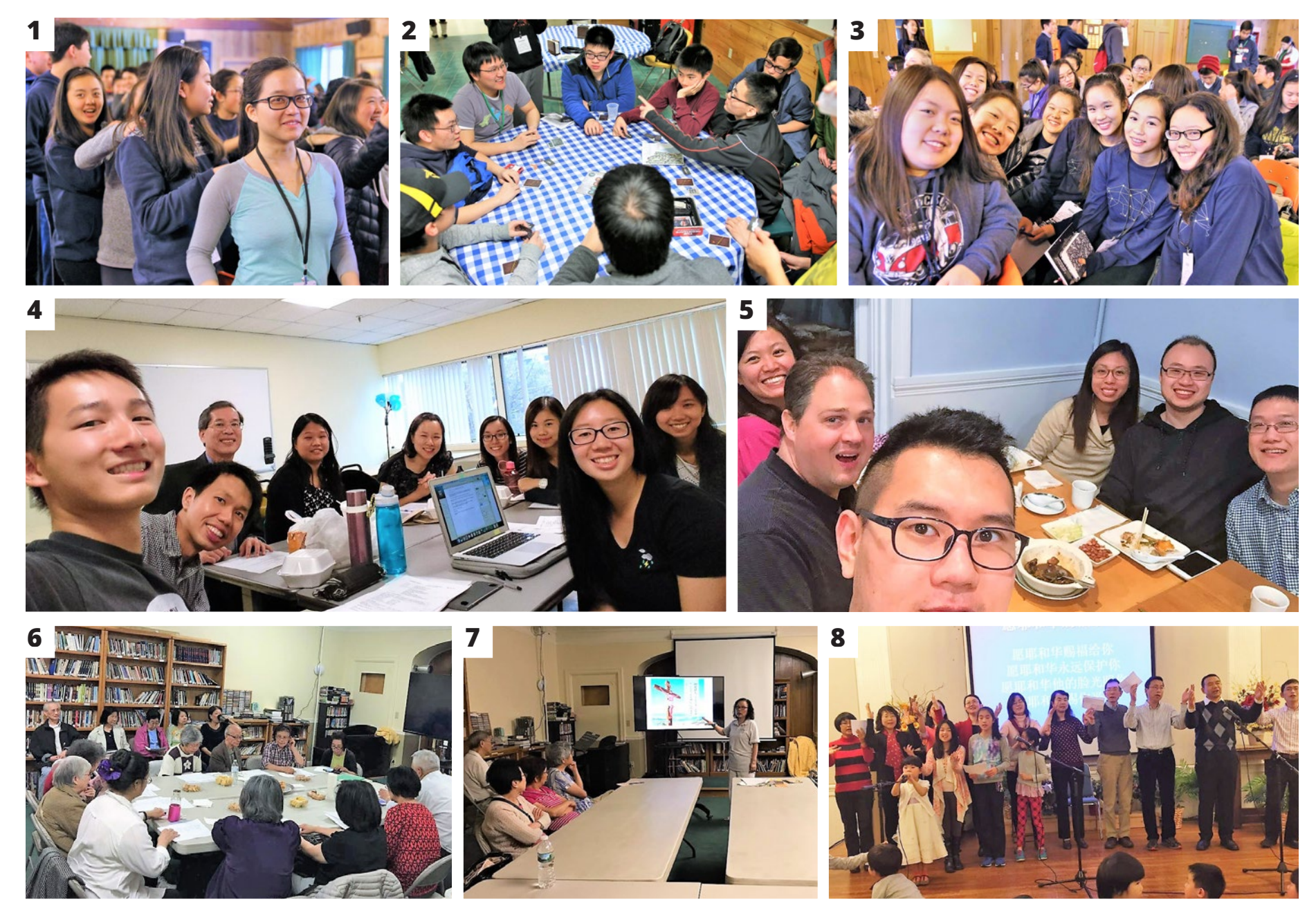
1-3) Teen Fellowship (Chinatown English Youth): Winter Teen Conference for high school teens 4) Joshua 2 Fellowship (Chinatown Cantonese College): Committee meeting 5) United! Bible Study (New Community Adult): Sharing a meal together 6-7) Enoch Fellowship (Newton Cantonese Senior): Workshop and Bible study 8) Newton Mandarin Fellowship: Singing hymns at Thanksgiving dinner celebration