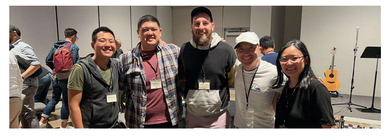
The English pastoral staff attended the Chinese Heritage Church Collective together.