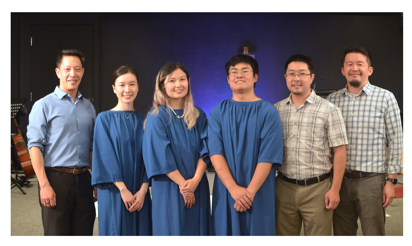
Three brothers and sisters were baptized at Boston Chinese Evangelical Church's Newton Campus.

Baptisms for the English Congregation took place on April 9 and July 9 at Boston Chinese Evangelical Church's Newton Campus. May the blessings of the wonderful day fill their lives with joy and peace forever.