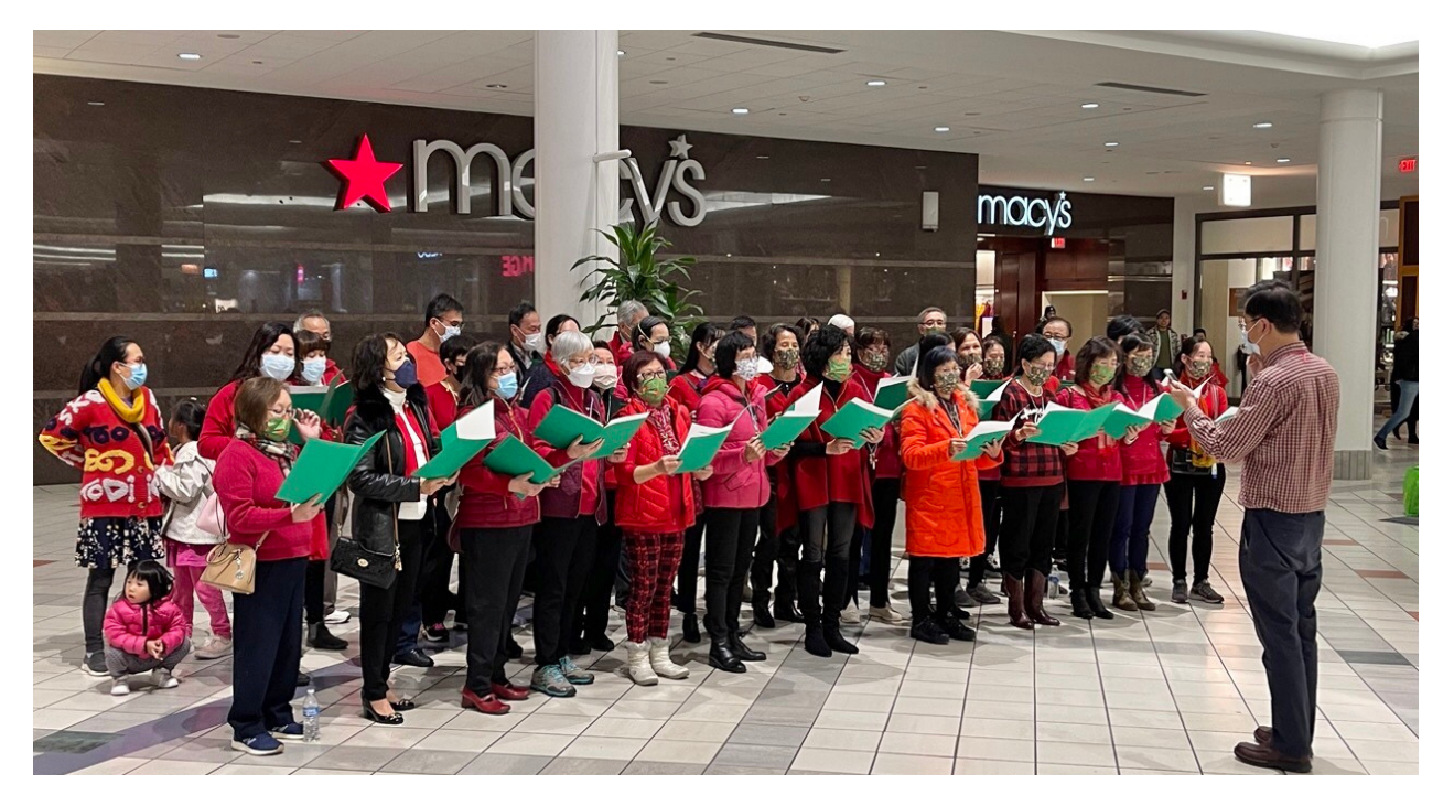
Boston Short Term Mission went caroling at South Shore Plaza in December 2022.

In early November, BSTM reached out to South Shore Plaza, stayed in contact, and even signed a contract; however, on the first day of Winter Local Mission, we still had not received notice about the precise indoor location of our performance. As a result, a decision to cancel was being considered, but a reply eventually arrived in the evening before our activity. In addition, we had previously scheduled a performance date with South Cove Manor, but reality always sets in and shakes things up. Fortunately, we found a solution to the issue, and the last-minute Christmas card giveaway following the carols was warmly welcomed by the senior residents unexpectedly. We really thought the easiest part was caroling at the Chinatown Gate. However, at the scheduled time, no one showed up. To our relief, we found out that the participants were only late because of traffic.