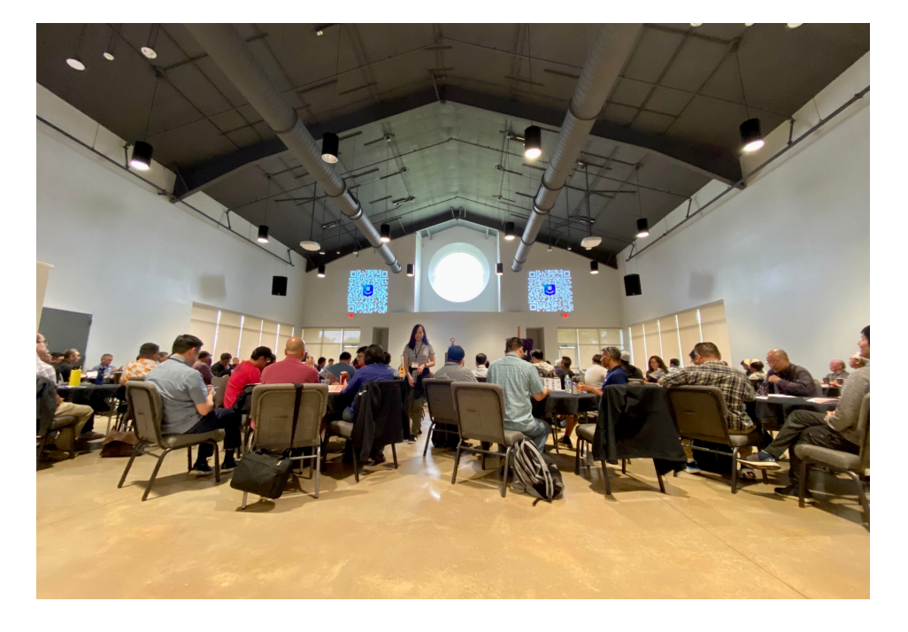
The Chinese Heritage Church Collective brought together church leaders from North American churches.

I really enjoyed meeting many pastors, ministers, and lay leaders at the Collective. We exchanged lots of ministry ideas and helpful resources with one another. There were memorable sessions during our two and a half day gathering. Two were particularly poignant. The first was about a church that struggled through a dramatic church split. In the end, the pastor persevered through grace, stood firm in God's calling, and endured. I couldn't help but am thankful for the wonderful and humble leadership of past and present pastors and leaders, which kept BCEC away from such devastation.