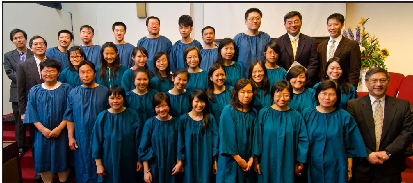
April 24, 2011 Baptism