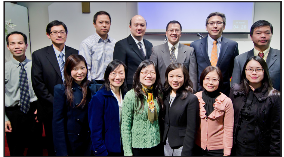
Board of Deacons (BOD)