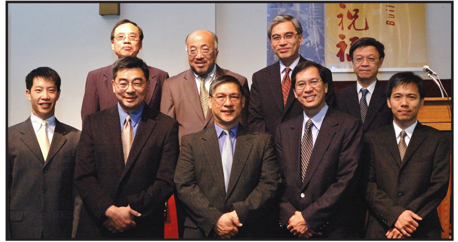
Board of Elders (BOE)

Right now, we have more questions than answers. But we ask for your prayers so that God would grant us wisdom, grace, and courage to confront these issues head on because we desire for God to continue to use BCEC so no generations will be lost to the Gospel of Jesus Christ.