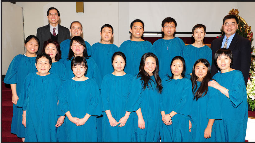
December 5, 2010 Baptism